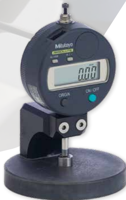
Mitutoyo Measuring Gauge

Alternatively, tablet weight and thickness can be entered into the TBF 100i system manually.