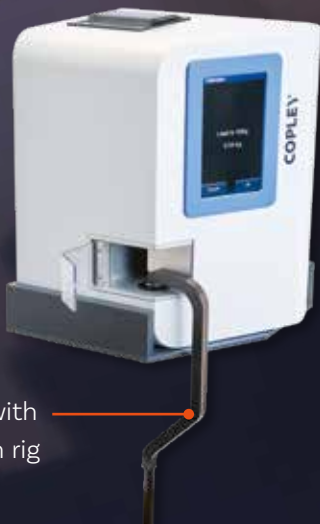
TBF 100i with calibration rig