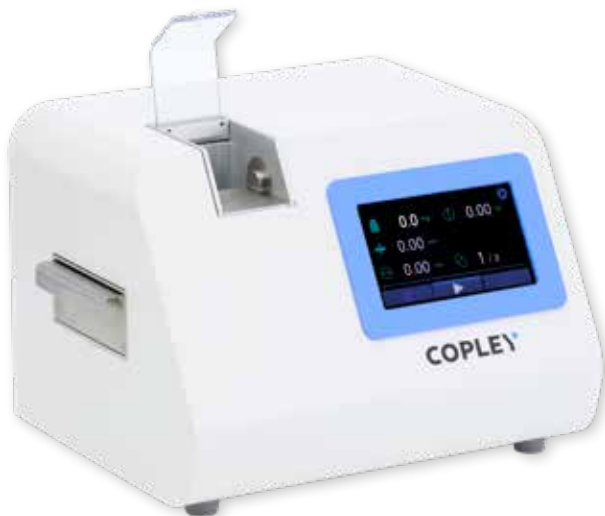
TBF 100i with open guard