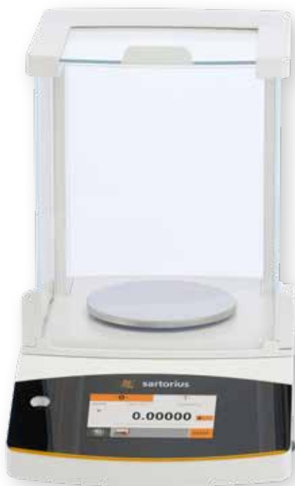
Sartorius Balance Model Quintix 224-1 CEU